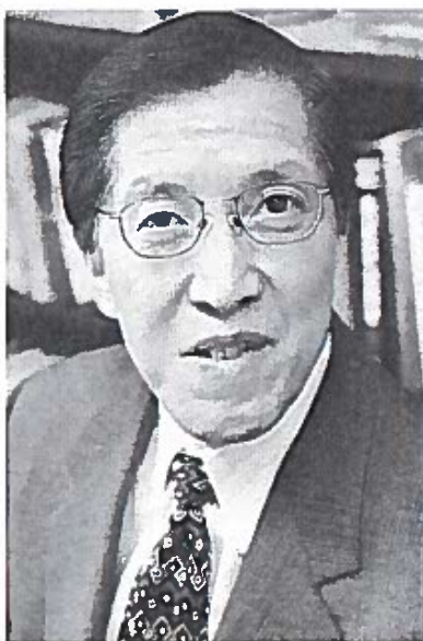
Derald Wing Sue

racial microaggressions has been proposed to explain their impact on the therapeutic process.